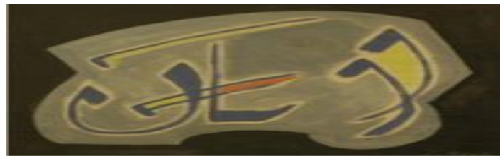
Resim 15: Şemsi Arel, 27x30cm, Oil Paint