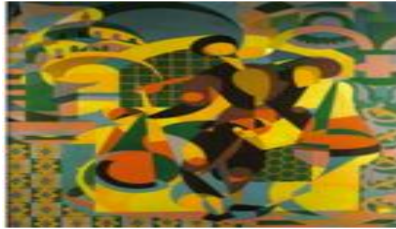
Painting 13: Sabri Berkel, Yoğurtçu II (Yoghurt Seller II) , 1954, 162x130, Oil Paint on Canvas