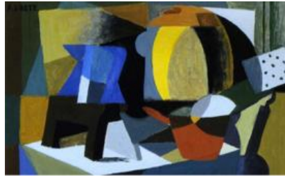
Painting 3 : André Lhote, Abstract Still Life , Water Paint

In all movements emerging after this vision put forward by Cezanne setting a way between expressionism and cubism, we encounter a geometric order (Painting 1). Particularly, such artists as Picasso, Lhote, Braque frequently applied in their works to the method of separating geometric elements, figures and objects into geometric parts in their own period, however, these are not pure abstract works of art (Painting 2-3). Their exposure to the objects in an order is only a tendency of abstraction.