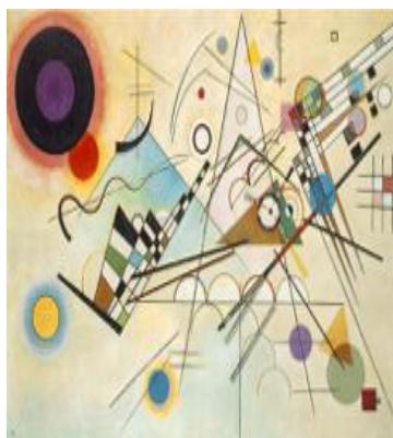
Painting 4: Kandinsky, Composition VIII , 1923

(...) the artistic urge at the beginning is nothing to do with the imitation of nature. It chases pure abstraction as the only state of stillness in the complexity and darkness of the image of the world and creates geometric abstraction depending on himself in a completely instinctive way. The artistic urge is the only expression of completed and only one suitable for the human being of liberation against all the circumstances and temporality of world image (Cauquelin, 2005: 75).