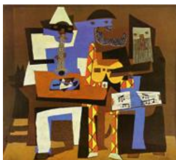
Painting 2 : Pablo Picasso, Three Musicians , 1921, Oil Paint