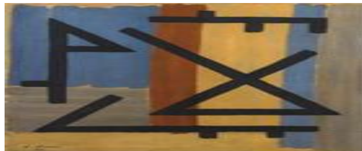
Painting 16: Şemsi Arel, Kufi Kompozisyon, (Cufic Composition) 1956, 70x86 cm, Oil Paint