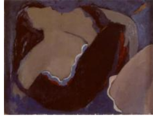
Painting 17: Ferruh Başağa, Aşk (Love)

As a matter of fact, Sabri Berkel with his subjects bearing simple and traditional components and Şemsi Arel taking Cufic and Islamic calligraphy as a starting point are the best example, as mentioned above, in the place of it in the abstraction of local abstractions. In geometric arrangements, contrary to depicting nature we see so often up to now, it is observed that they broke away from it and traditional conception completely. In 1949, we see that the figure completely vanished in the painting “Aşk” (love) of Ferruh Başağa winning the first place award of Ahmet Çanaklı in the State Painting and Sculpture Exhibition, and he broke away from the model (Painting 17).