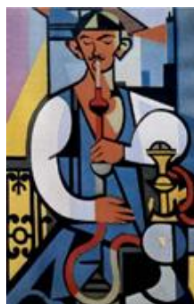
Painting 7: Nurullah Berk, Nargile İçen Adam , ( Man Smoking Nargile ) 60x93 cm, Oil Paint

İstanbul Museum of Painting and Sculpture