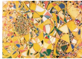
Painting 19: Fahrünnisa Zeid, Abstract Composition