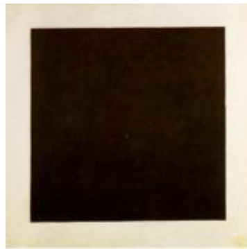
Painting 6: Kazimir Malevich, Black Square , 1913, 106.2x106.5 cm, Oil Paint

Geometric forms we started to see in the art of painting with Cezanne went on with the melting of optic forms of objects in cubism. However, geometry in supremacism put forward with the effect of Futurism and Cubism by Malevich as the first geometric abstraction sample in Russia got rid of the context and concern for context. The best example for this could be given as “Black Square” painted on white by Malevich in 1913 (Şener, 2010: 51 -52).