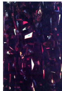
Painting 10: Nejad Devrim, Abstract Composition , 174X185 cm, Oil Paint on Canvas İstanbul Museum of Painting and Sculpture

We mentioned about the reasons for a delay in Turkish painting to catch the time above. If we are to deal a lot more with the issue, it is likely to say that universal and the local social event had an impact on this delay as well as our transition to plastic art past. In an orientation to abstraction in the west, the Second World War had a profound effect but Turkey did not join in the war but felt the influence indirectly. While all the world was fighting against such a big depression, it was impossible for us not to be affected by it. The world was changing and our local changes were also reflected in our art. The results and effects of the Second World War, scientific