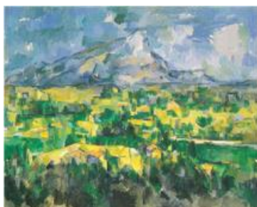
Painting 1: Paul Cézanne, Mont Sainte-Victoire , 1905

(...) the perception of the world with a perspective showing the places and locations of the objects from Renaissance onwards has changed and it has been replaced by a new perception not based upon optic vision without a perspective and leading to the real judgements of objects and real form relations. With a start to perceive the objects in geometric structures, a new nature and a world of essences comprising the core of objects were started to obtain. An orientation to the super sensuous universe through science was first found in the paintings of Cezanne in art. Cezanne points out that he would like to depict nature according to cubes and cones. Objects are perceived as plain geometric forms, cylinders, cones and cubes. It means to take the nature out of a visible optic world, a sensual world and make it a nature that could be considered (p 8-9).