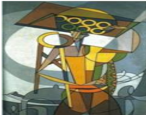
Painting 14: Sabri Berkel, Simitçi, (Bagel Seller) 1952, 162x91cm, Oil Paint on Canvas